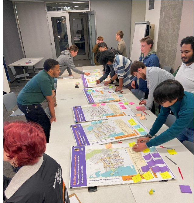
Figure 5: Participants at the ASUC listening session

Comments included broad support for network recommendations, requests for more robust intersection treatments, requests for additional separated bikeways, and requests for additional Bicycle Boulevards.