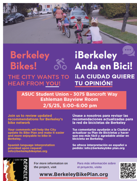
Figure 1: Example of outreach event flyer

All project advertising materials were provided in English and Spanish.