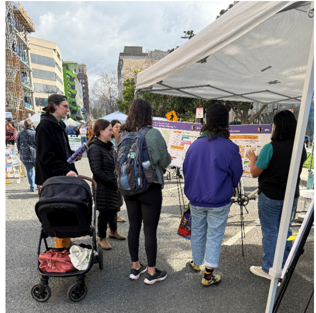
Figure 4: Residents at the Downtown Berkeley Farmer's Market

A small subset of participants attempted to engage the project team in detailed discussions surrounding the City's Complete Streets policy and the recommendations development process.