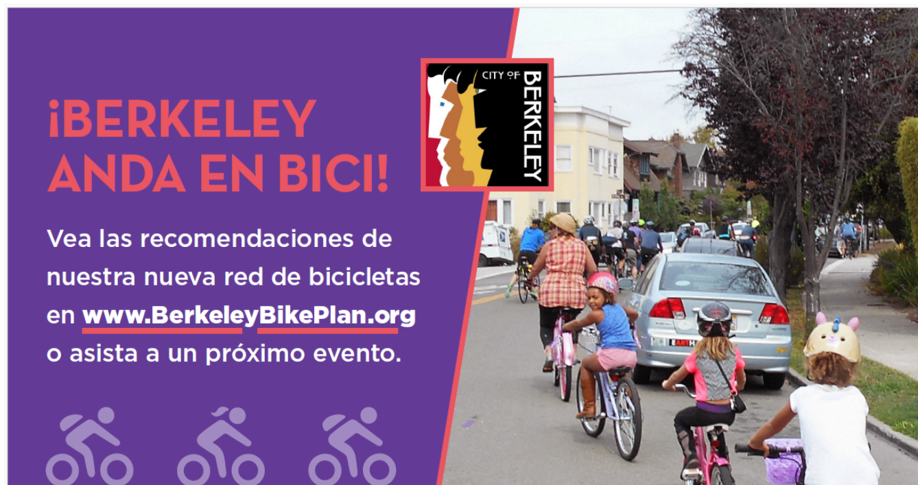
Figure 2: Example of social media art for 2025 outreach