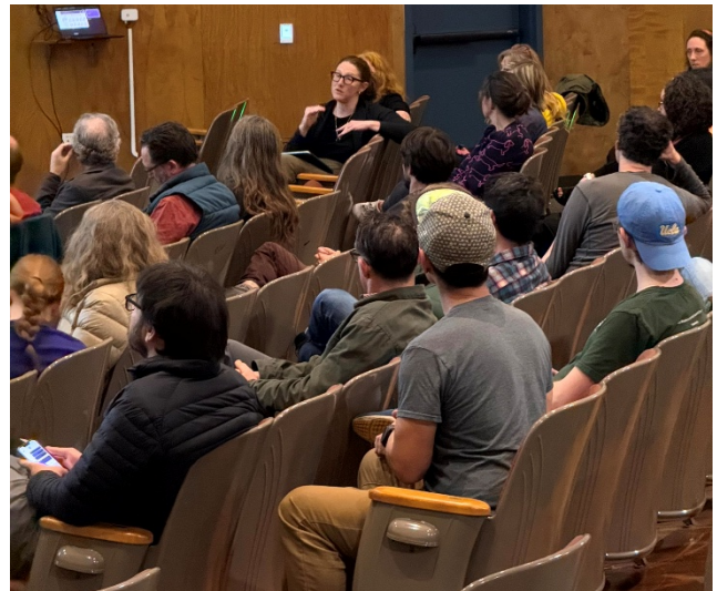
Figure 6: Participant discussion at the MLK Middle School listening session

Comments at this meeting focused primarily on wanting the City to implement more robust bike network solutions and to implement them more quickly. Comments expressed frustration at City of Berkeley Public Works for not fulfilling past Bike Plan recommendations during paving projects, such as Rose Street. Attendees strongly supported re-starting the Hopkins Street proposal for separated bikeways. Comments focused on designing projects nearby schools with additional emphasis on traffic calming, traffic diversion, and physical separation to provide maximum safety and comfort to youth. There were also competing opinions about the role of traffic enforcement in improving overall safety.